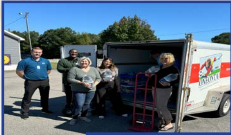
Clayton Homes of Raleigh and Oakwood Homes gathering supplies to be donated to Western North Carolina!